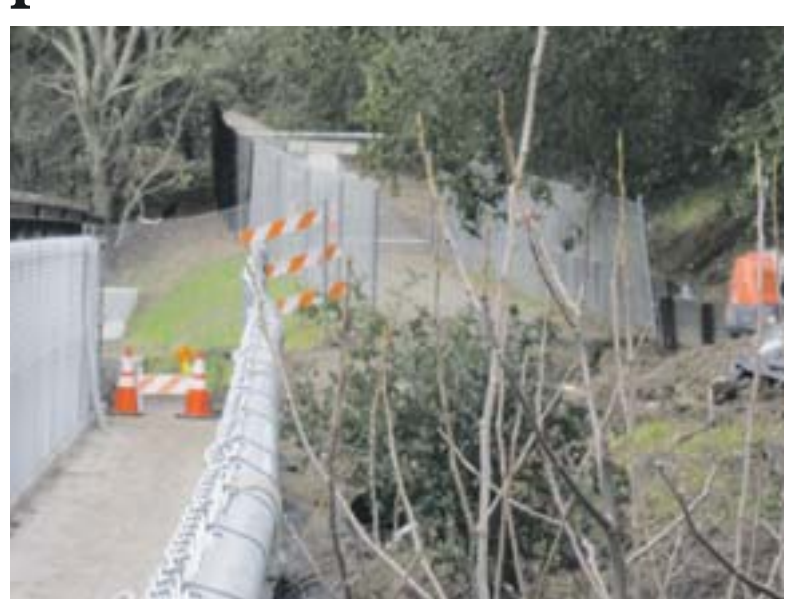
Canyon Bridge pedestrian access closed